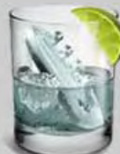
Fun Ice Trays & Kitchen Stuff