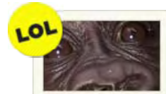
Amazing New Species Discovered