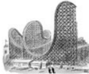
STOCK MARKET THE RIDE