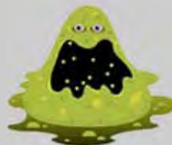
Funny Science T-Shirts