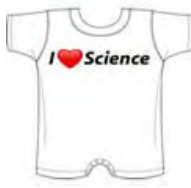
I Love Science Baby Onesies / T-Shirts